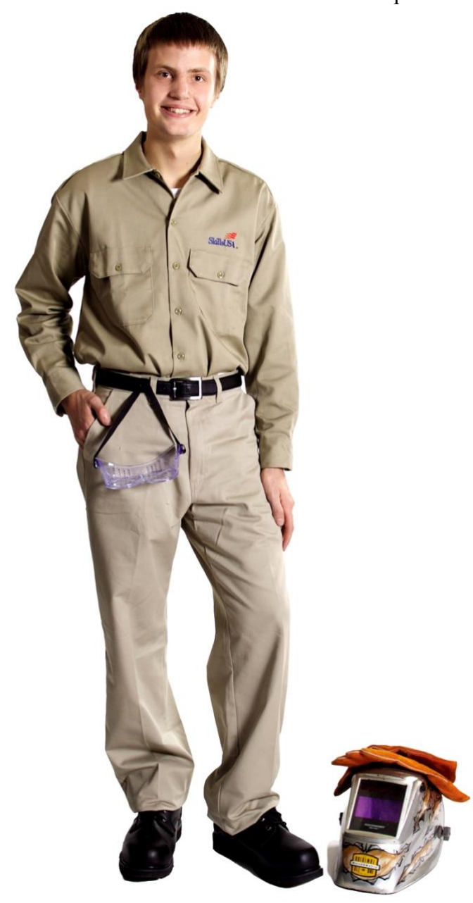
SkillsUSA Championships General Regulations, 2025 • 13

Participants may wear solid khaki colored work shirt and pants OR blue jeans with SkillsUSA Missouri Red Polo OR clean, plain "carpenters whites." Welding & Welding Fabrication will require long sleeved solid color work shirt made of heavy wool or heavy cotton (no t-shirts) in addition to PPE. All other accessories are required.